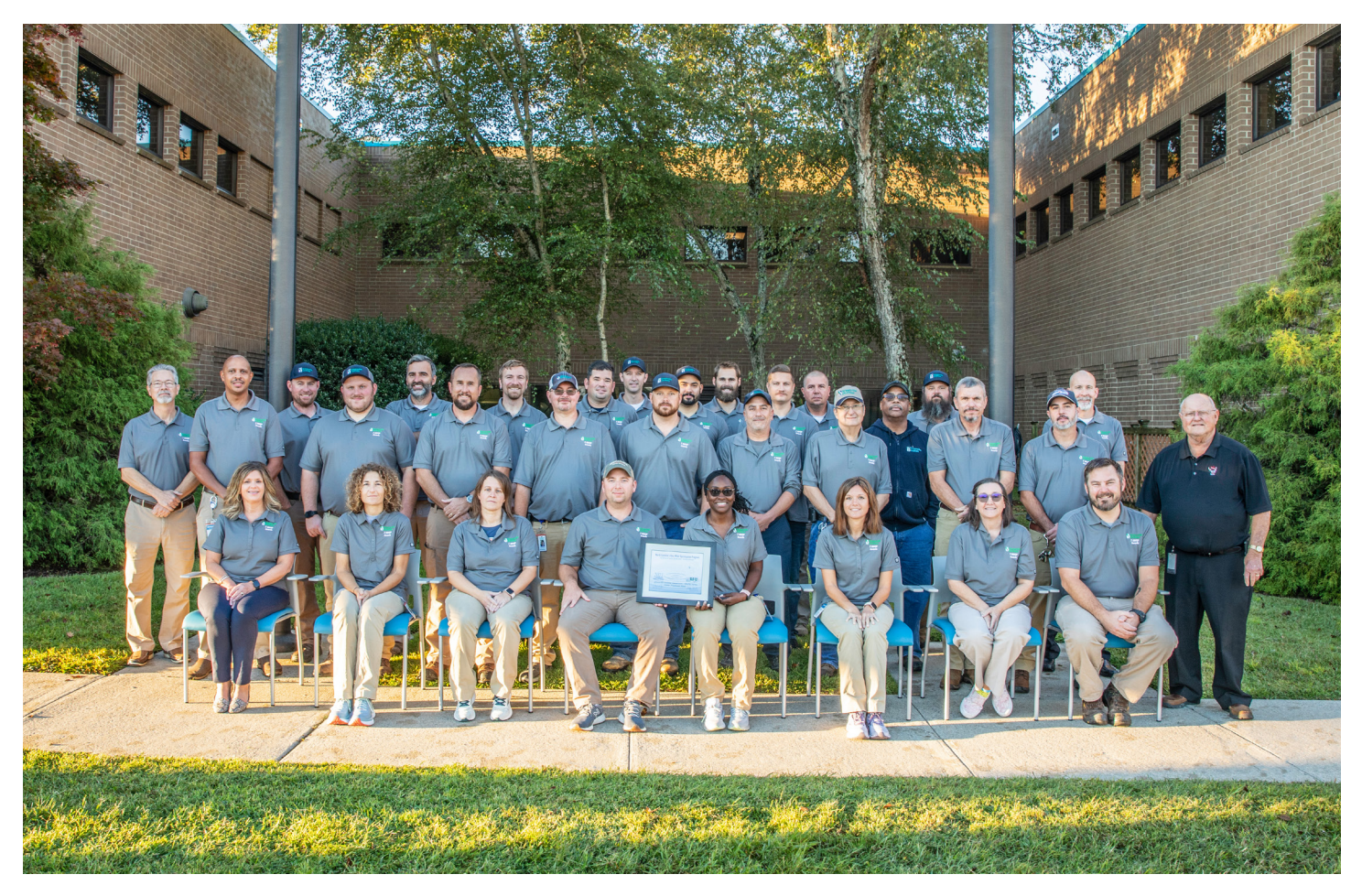
GUC was awarded its 7th consecutive Area Wide Optimization Award and the Partnership for Safe Water Directors Award in 2022.

SUSCEPTIBILITY WATER SOURCES Higher: Water Treatment Plant Moderate: WSW Well, SSW Well, EPW Well