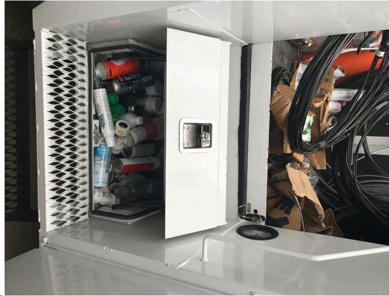
Curbside 3 rd vertical