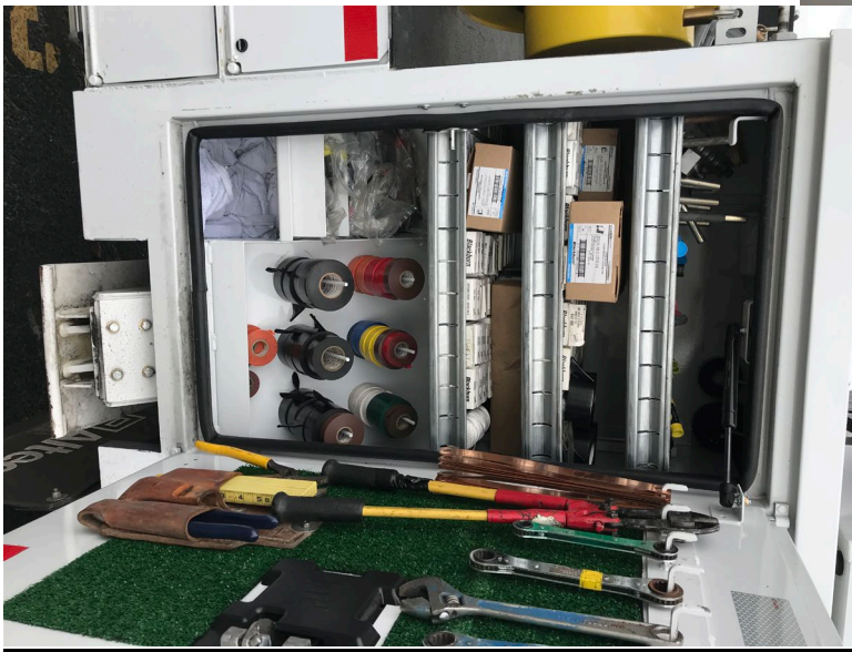
Curb side horizontal