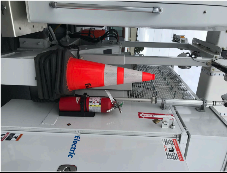
Street side 3 rd vertical