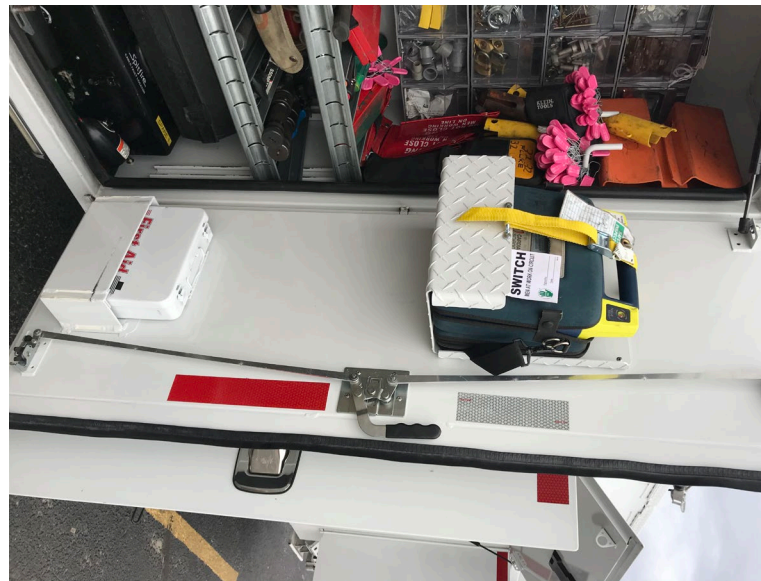
Street side rear vertical