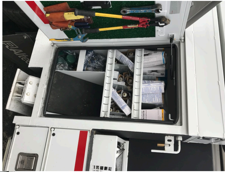
Curbside 1 st and 2 nd vertical