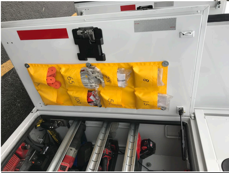
Street side 1 st horizontal