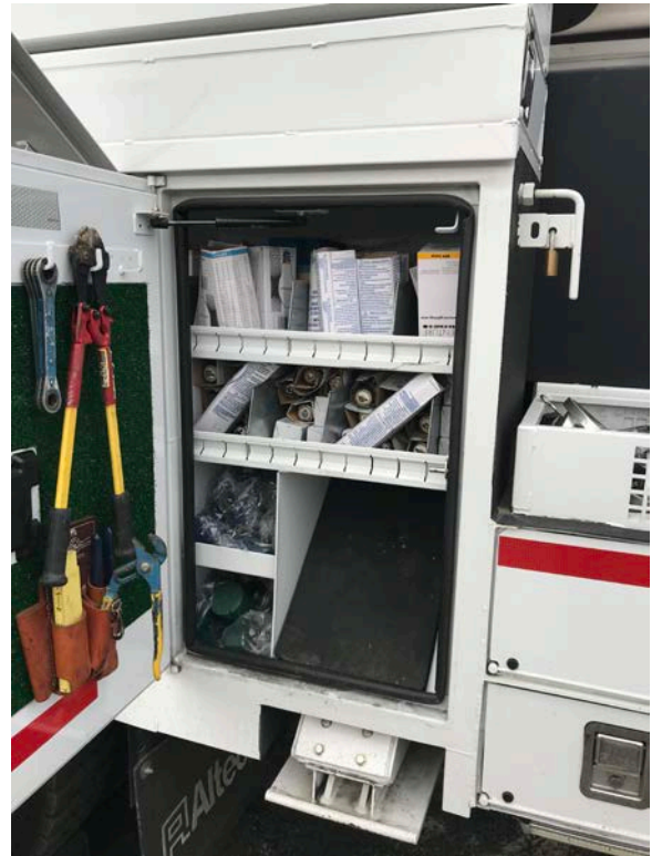
Street side rear vertical