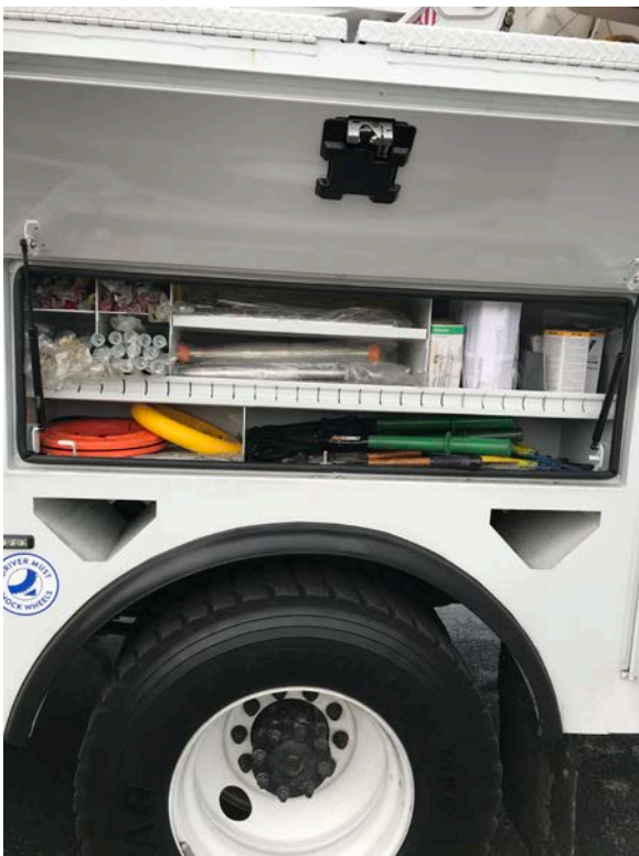
Street side 1 st horizontal