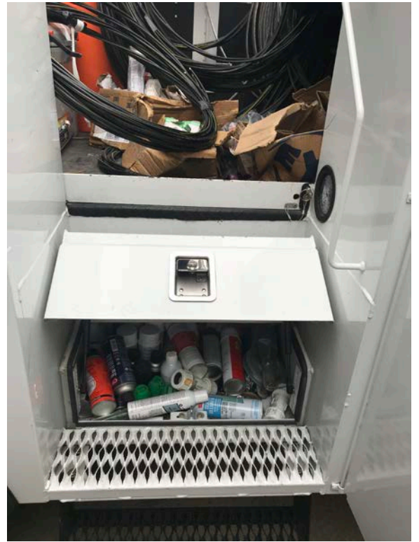
Curbside 3 rd vertical