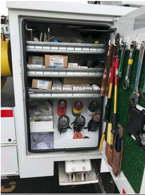
Curb side rear vertical