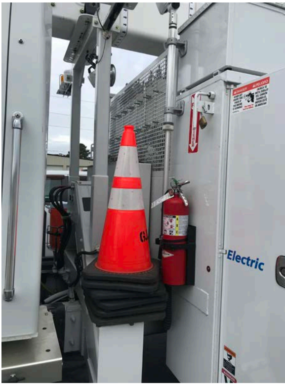
Street side front outrigger