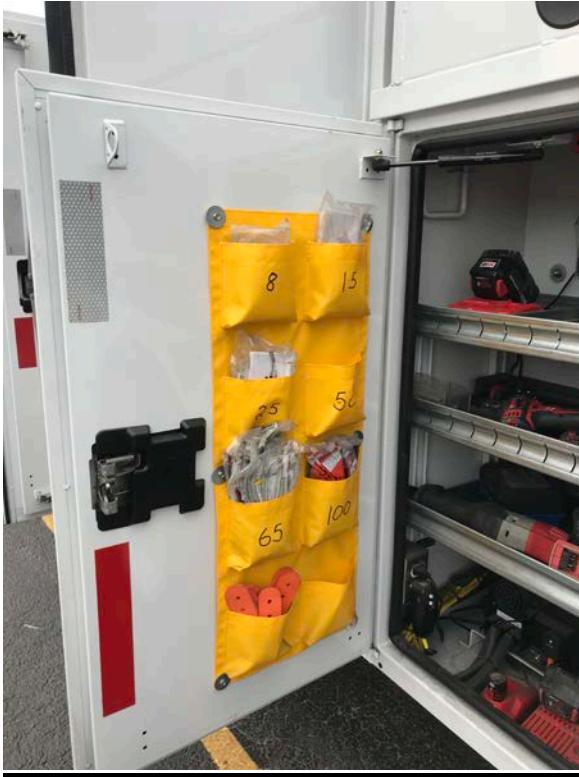
Street side 3 rd vertical